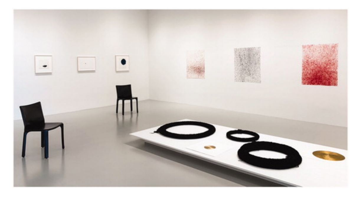
Figure 2. Anne Wilson, Exhibition installation at Rhona Hoffman Gallery, Chicago, USA, 2020

Twenty textiles—a mix of framed and unframed—were presented at eye level, while the eponymous work of the exhibition. If We Asked about the Sky (Figure 3), was installed high enough to require viewers to look up at the work, and Absorb/Reflect necessitated viewers peer downward to the floor. If We Asked about the Sky is a large damask cloth flecked with ink and stitched with human hair. Wilson suggests the "work proposes both smallness and vastness and inhabits a space of contemplation between the mortal world and a celestial universe that is infinite and unknowable."<sup>3</sup> In many other works we also see the micro-level of the droplet in indigo colored ink or the crimson blood of an embroiderer's pricked finger (Figure 4), as well as the human hair which Wilson first began embroidering into works from the early 1990s. Made after my autumn 2019 studio visit, Absorb/Reflect draws on earlier works Wilson made at the height of the HIV/AIDS epidemic in the late 1980s as, she explains, a "gesture of care and remembrance to someone grieving."<sup>4</sup> Sharing the same floor plinth with the black ribbon garlands are several gold roundels: disks of hope in these dark times.