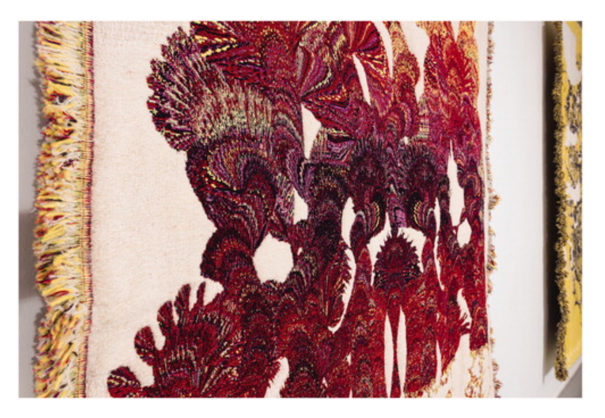
Figure 5. Kustaa Saksi, In Full Bloom (detail), 2019, Jacquard Weave 165 x 236 cm (66" x 93"). Mohair, Silk, Acryl, Cotton, Wool, Polyester. Edition of 6.

Despite the fact that I did visit First Symptoms , peering in the winter night-lit windows and later returning during daylight, I have to confess that my eyes still did not understand all that I was seeing. The crimson Aftermath (2019) and In Full Bloom (2019) suggest worm holes, intestines (Figure 5). But writing to the artist after the show I inquired about the white paint layered over the yellow woven ground of Attack (2019) (Figure 6). The materials list is silk, mohair, linen, polyester, rubber and wool. Saksi explained that what I thought was paint, even when standing in front of the work, is a rubber covered yarn.