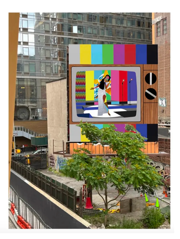
PHOTO BY DERRICK ADAMS; LEFT: SITTING PRETTY , 2016 (RENDERING); RIGHT: SING IT LIKE YOU MEAN IT , 2016 (RENDERING).

The High Line today announces that two vibrant works by Derrick Adams are now on view on the High Line – Moynihan Connector Billboard, which overlooks the entrance to the Lincoln Tunnel from its location on Dyer Avenue between 30th and 31st Streets. The unique doublesided vertical billboard features two commanding depictions of Black people, broadcasting the figures' warm self-assurance to the park visitors and passersby below. Each side's figure is set against the Technicolor backdrop of a TV test pattern, suggesting the reset of cultural