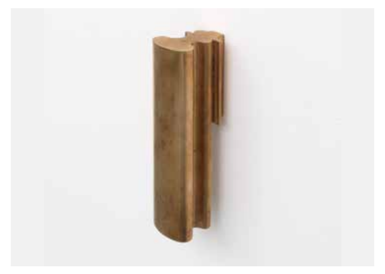
Limb (section), 2020, cast bronze, 10.75 x 2.75 x 3.25 inches