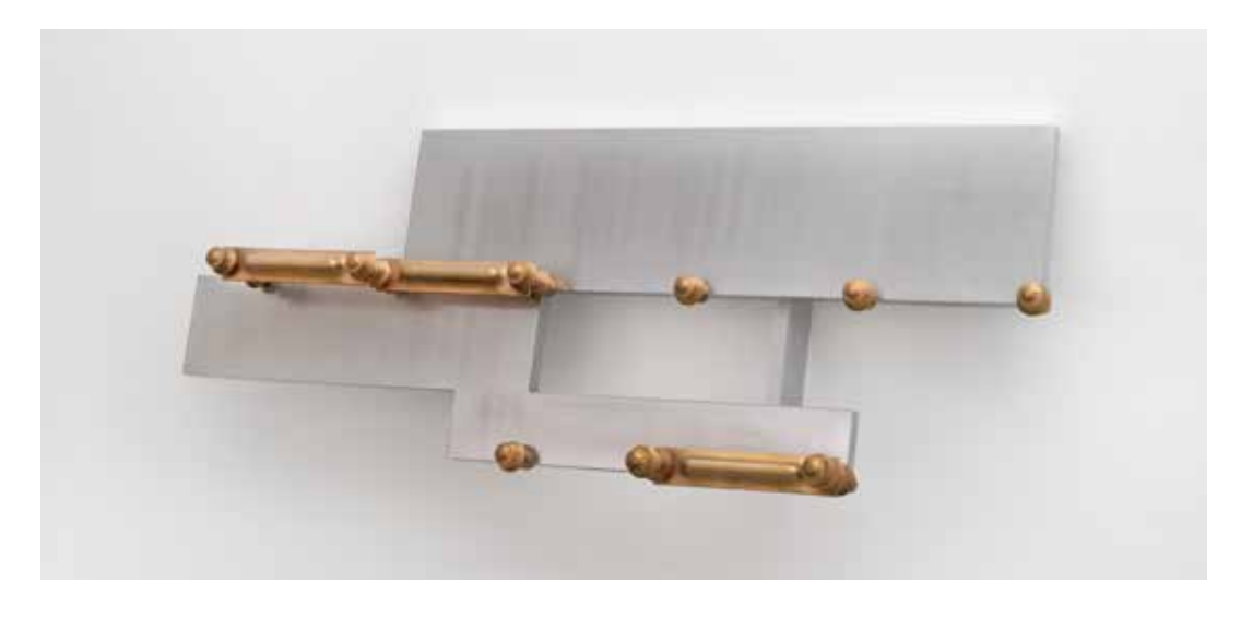
Left: Marking , 2020, cast bronze and aluminum, 15 x 37 x 9.25 inches

Below left: Untitled (21-01) , 2021, cast bronze and aluminum, 28 x 23 x 8.5 inches