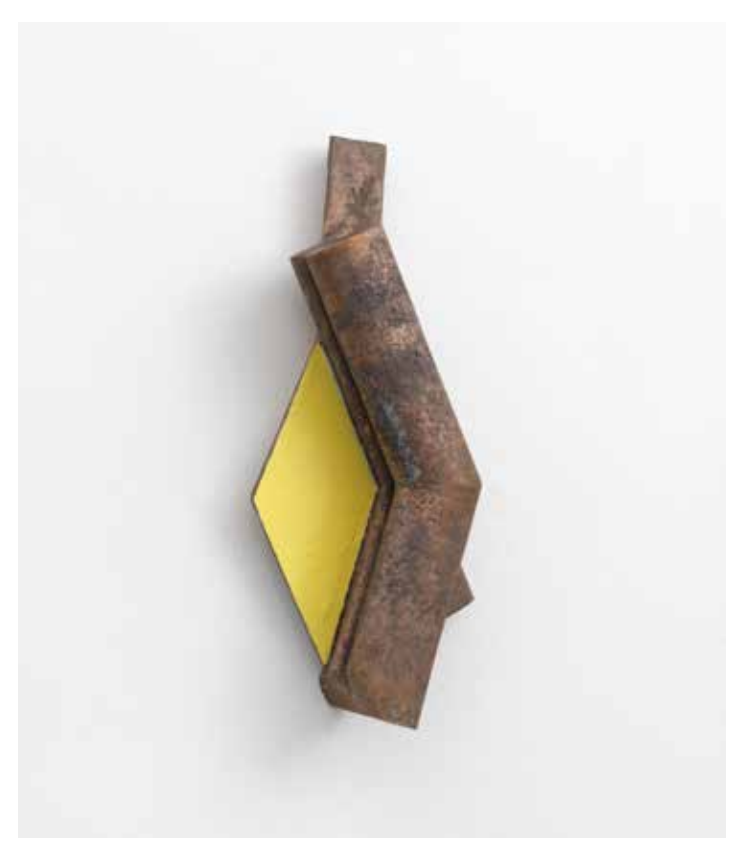
Limb (yellow), 2020, cast bronze and oil paint. 17.25 x 7.25 x 3.25 inches